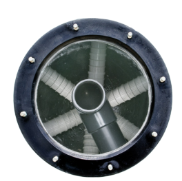
ABS Collector Arms