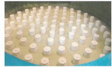
Nozzle Distribution System