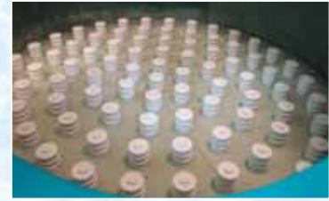
Nozzle Distribution System