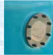
Sight Glass - 200 mm